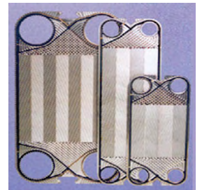
Plate and Frame, Keel Coolers Brazed Plate, Etc.