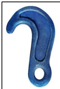
Shallow Eye Hook