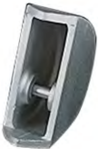
BOW TOWING POCKET

Install on Vessel Bow for Towing 713 Aluminum