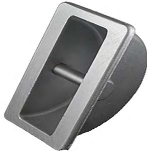
RECTANGULAR FLUSH TIE DOWN

5.55 or 4.23 Inch Diameter Aluminum with SS Pin