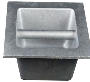
RECTANGULAR FLUSH TIE DOWN