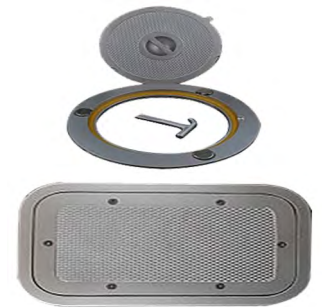
HATCHES AND INSPECTION PORTS