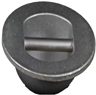
ROUND FLUSH TIE DOWN

5.55 or 4.23 Inch Diameter Aluminum with SS Pin