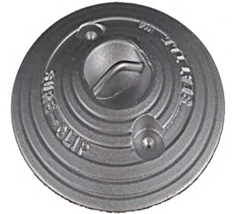
ROUND RAISED TIE DOWN